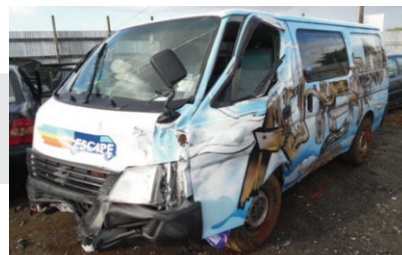
Vehicle write-off $22000+

Damage on your van is the least fun aspect of any trip - for both you and us – so take a few minutes and have a read of all our insurance options on the next page.