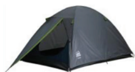
Two-Man Tent $70