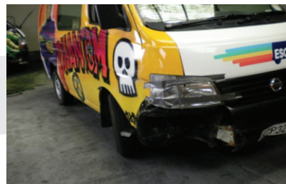
Front corner damage $1000