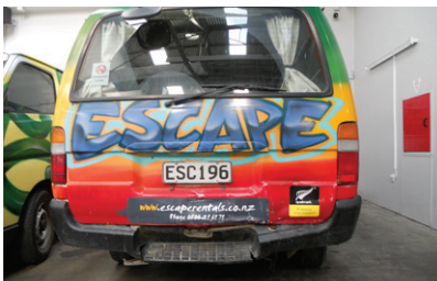
Rear door replacement $2000