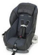
Child Seat $50 (child must be 12 months or older)