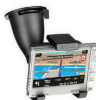
GPS - $10/Day* (to a max. of $150)