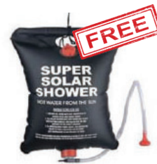
Solar Shower $0