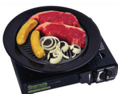
Portable BBQ $50 (include 1 gas cartridge)