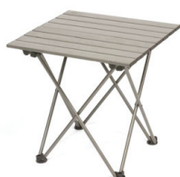
Picnic Table $40