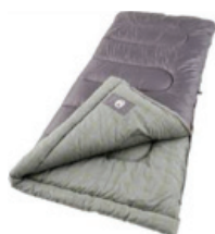
Sleeping Bag $50