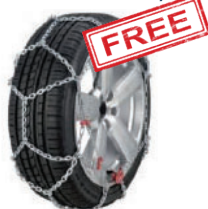
Snow Chains $0 (winter months)