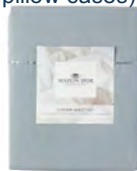
Additional Linen $60 (brand new linen pack of 2 sheets & 2 pillow cases)