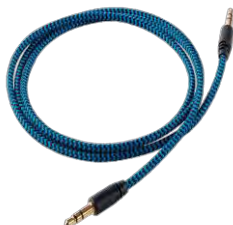
Auxiliary cord $12