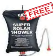
Solar Shower $0