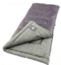
Sleeping Bag $75