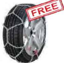
Snow Chains $0 (winter months)