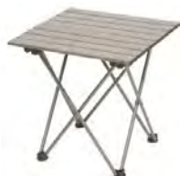
Picnic Table $40