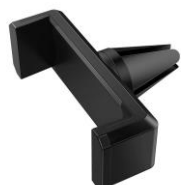
Vent Phone holder $12