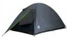
Two-Man Tent $80